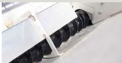
Full length auger.