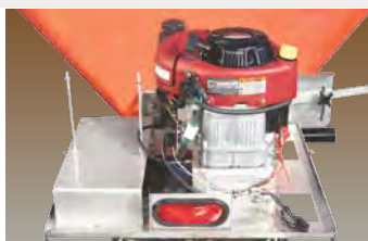
Gasoline engine drive.