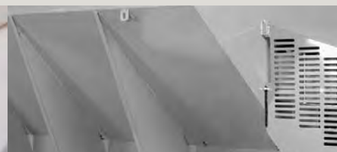
Available in stainless steel.