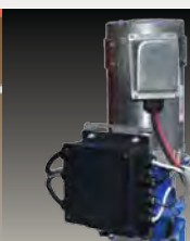
Electric motor drive.