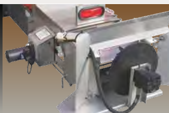
Hydraulic motor drive.