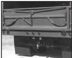
Eccentric lever top pin release