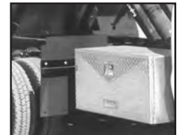
OPTIONAL front mud flaps OPTIONAL underbody tool box