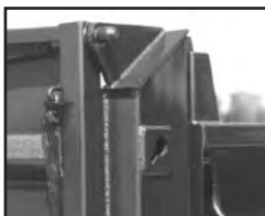
Sloped top center posts and spreader chain retainers