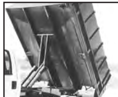
Low profile crossmemberless under-structure