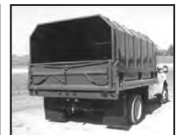
OPTIONAL removable chipper topper OPTIONAL rear towing hitch

Photos may not show most recent changes to models.