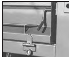
Dual cam side latches OPTIONAL tie down rail