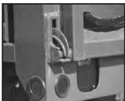
Forged steel base latches and FMVSS-108 lighting