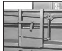
OPTIONAL metering (rock / material) chute