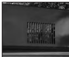
Slotted viewing window