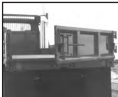
OPTIONAL dual purpose 270° swing-away gate