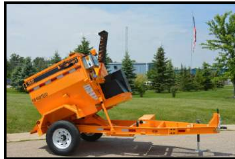
52 degree dump feature for discharge of entire material load