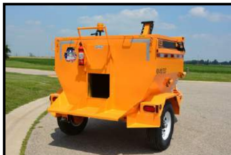
Single insulated shovel door on sliding track with safety latch

For full specifications or pricing contact KM International or an Authorized Dealer