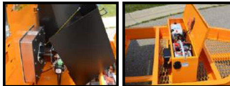
Burner and other key components are located above the trailer frame and in steel enclosure to protect from road debris and grime